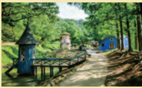
Tove Jansson Akebono Children's Forest Park