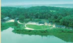
Metsa Village (Hanno City)

In Hanno City, you can spend wonderful time at "Mezza Village" where you can experience Nordic lifestyle and "Tove jansson Children's Forest" where you can feel the worldview of Nordic fairy tales. Please visit Hanno city for relaxing with leisure life and beautiful nature.