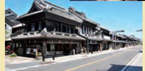
Kurazukuri Zone (Traditional Storehouse Zone) Kawagoe City

Kawagoe, known as Little Edo, has a look reminiscent of Tokyo in the period when it was called Edo. Ancient tradition and culture of Japan can be experienced in the street lined with old storehouses, Time Bell Tower, and the Kashiya Yokochi (Penny candy lane). The Kawagoe Hikawa festival (Kawagoe Festival) held every October is registered as UNESCO Intangible Cultural Heritage like Chichibu Night Festival.