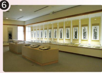
Yamato Art Museum

Learn all about the symbol of Chichibu, Mt. Buko, its geographical features and geology, flora and fauna, and the mining and use of limestone.