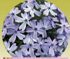
Oakington Blue Eye