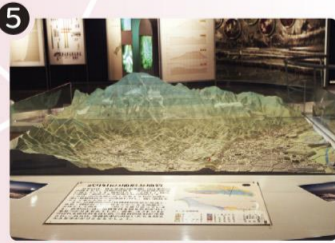
Mt. Buko Museum

A lookout with a good view of the city. In the distance behind the Muse Park you can glimpse Mt. Ryokami, one of the "100 famous mountains of Japan".