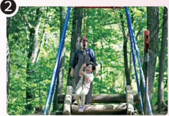
Wanpaku Kids' Park

Fureai pasture is home to a small number of sheep (hitsuji in Japanese). The park was named Hitsujiyama as it was previously the location of a sheep farm.