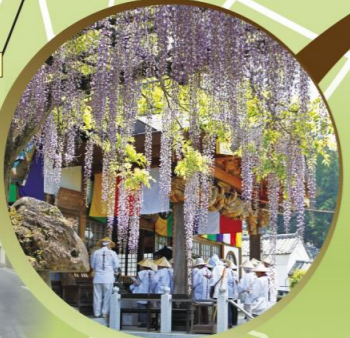
No.12 Fudasho Nosaka-ji Temple

Chichibu Fudasho Among the 34 temples or Fudasho on the Chichibu 34 Kannon temple circuit, temples 11 to 16 are situated downtown. In particular, the gardens of temple 12, (Nosakaji) and temple 15 (Shorinji) are beautiful.